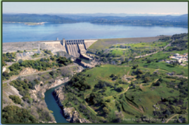
This picture shows an aerial view of Folsom Dam holding back the waters of the American River.

The source of our water is one of California's most prized, safe and clear natural water resources, the American River.