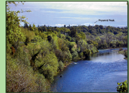
Runoff from Pyramid Peak is a main source of water for the South Fork of the American River