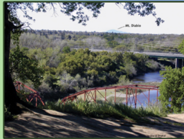
On a clear day you can see Mount Diablo from the top of the bluff.

From the Delta, some of the water is captured to be pumped down the state's aqueduct system and on to southern California or to field crops along the way. The rest of the water heads past Mount Diablo and on to Suisun, San Pablo and San Francisco Bays. Finally, the outbound tides sweep it through the Golden Gate into the Pacific Ocean.