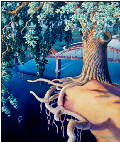
“Old Friends” - the popular blue oak on the Bluff overlooks the Fair Oaks Bridge in this work of local artist Hugh Gorman.

Since the 1970's, disputes had come up over title to this remaining open space, and one case had gone to litigation in April 1996. It was instigated by a developer and the owner of property adjacent to the Bluffs who wanted the County to abandon the right to its road easement in the area and to decree that the property belongs not to the public, but to them. The plaintiffs lost their case when the judge ruled that the County still owned the road easement.