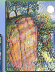
Bluff-scape by Dalia VisGirda

Local artists cherish the Bluff for its tranquil beauty.