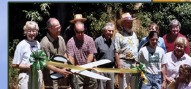
Ribbon cutting ceremony June 6, 2004

This sign was sponsored by Fair Oaks Recreation and Park District