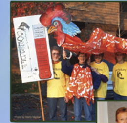
'Fundraising Thermometer' leads the parade

Local artists cherish the Bluff for its tranquil beauty.